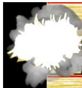
Figure 1.2 screenshot of the fight effect

Several of the sparks and smoke will explosive from the start point which the node two animals fight. Figure 1.2 shows a screenshot of the effect.