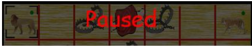
Figure 2.1 semi opaque background paused menu effect

The game play screen contents AI logic and multiple play screen contents multiple player control logic. For pause menu screen and quit confirm screen, the background is semi opaque. The effect of that show in figure 2.1. The game broad show through the semi opaque black background so that player can save their game step during pause and continue when resume .